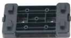
Transmitter Mounting Bracket (Included)

Call or email us today for more information: